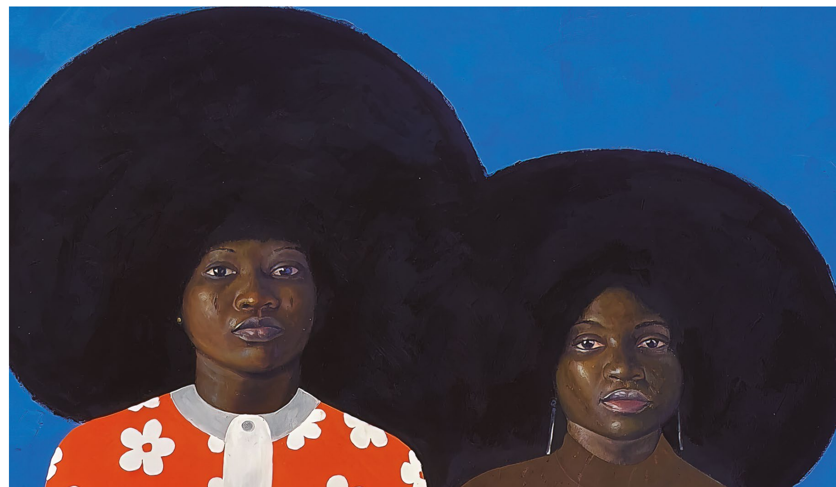
◀ BOND | 2021 72 53 / 64 in H x 55 1 / 8 in W | 185cm H x 140cm W | Oil and acrylic on canvas