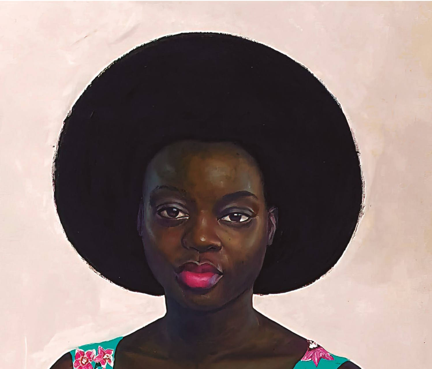
SITTING LADY | 2021 ▶

The wake of this growing demand and access to contemporary art, took place against the backdrop of a heightened political climate; marked by the murder of George Floyd in the United States, the rise of right wing nationalism globally, and a growing cultural renaissance and spirit of self determination amongst the African diaspora.