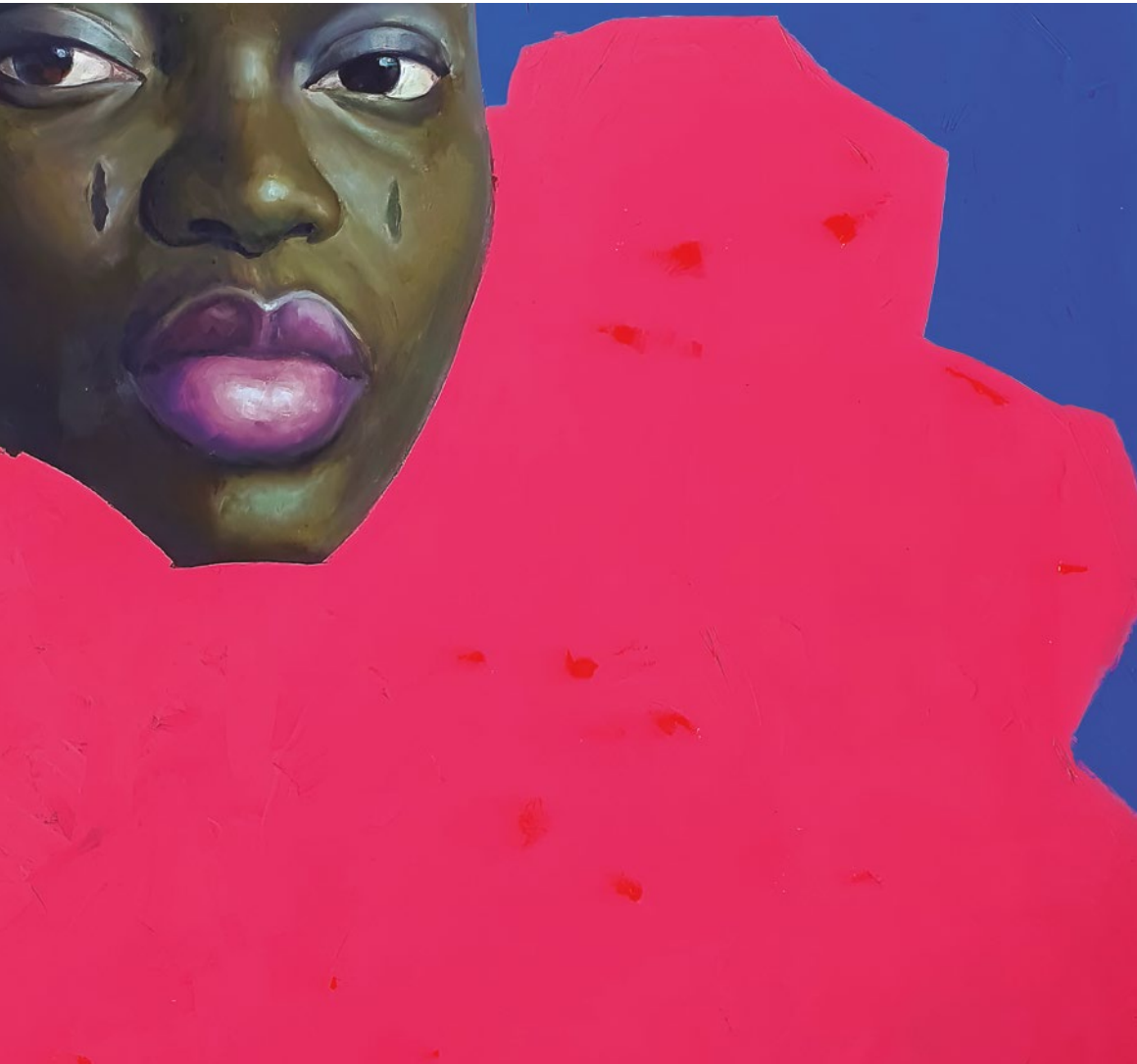
BOSS LADY (Invader series) | 2021 ▶ 51 3 / 32 in x 51 3 / 32 in | 132cm x 132cm | Oil and acrylic on canvas