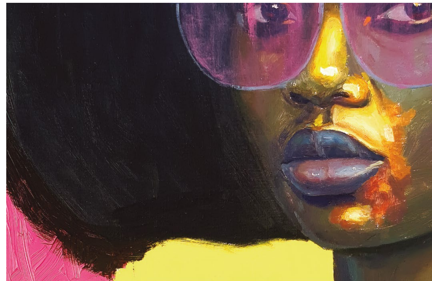
◀ UNTITLED YELLOW | 2022 26 3/8 in H x 27 11/64 in W | 67cm H x 69cm W | Oil and acrylic on canvas