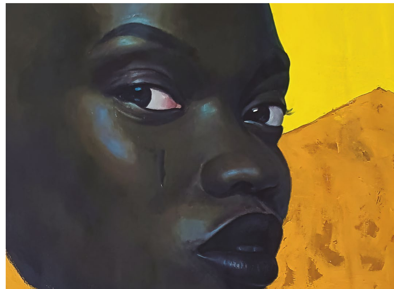
◀ FEARLESS (Invader Series) | 2021 51 31 / 32 in x 51 31 / 32 in | 132cm x 132cm | Oil and acrylic on canvas