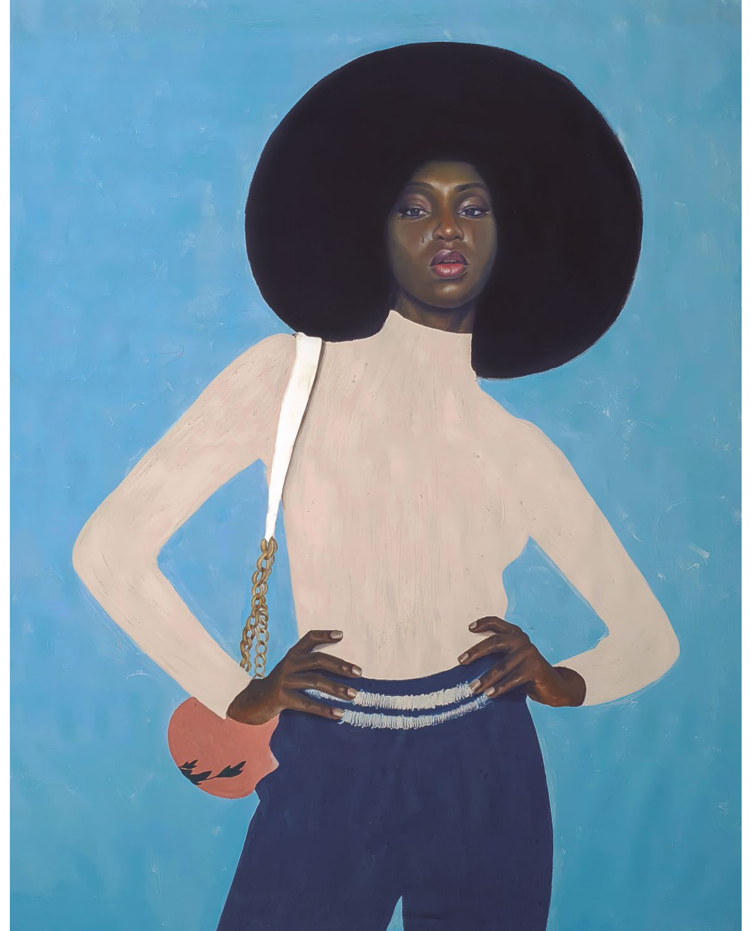
ATTITUDE | 2021 ▶ 72 5 / 4 in H x 57 3 / 2 in W | 185cm H x 145cm W | Oil and acrylic on canvas