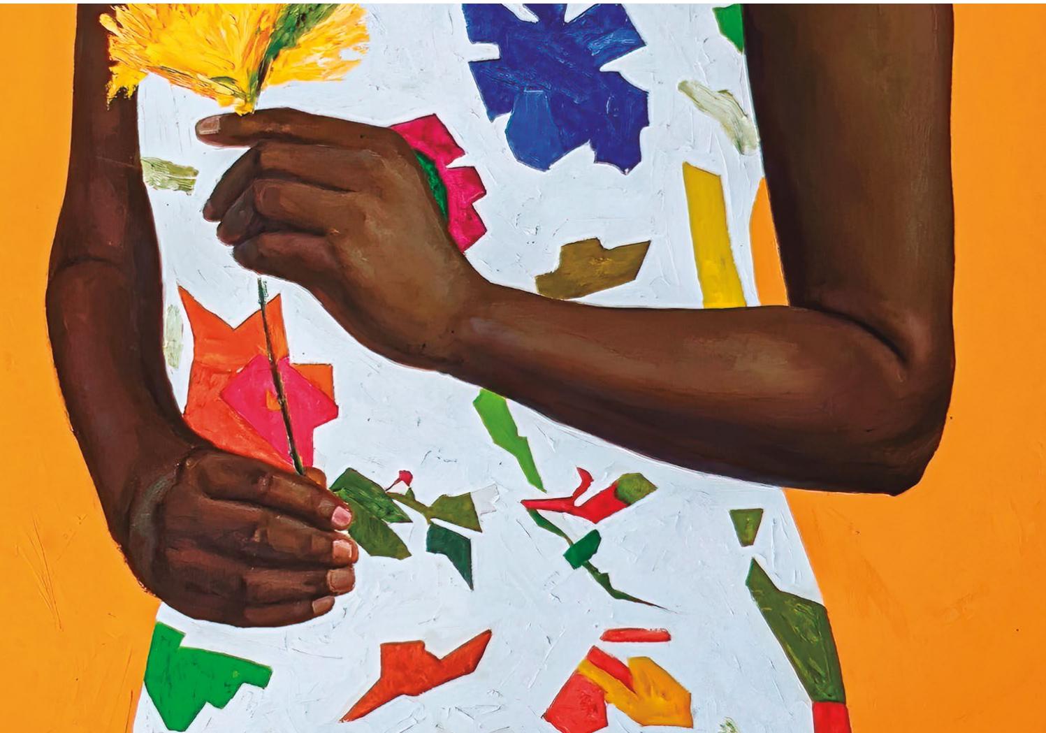
ASSURANCE | 2021 ▶