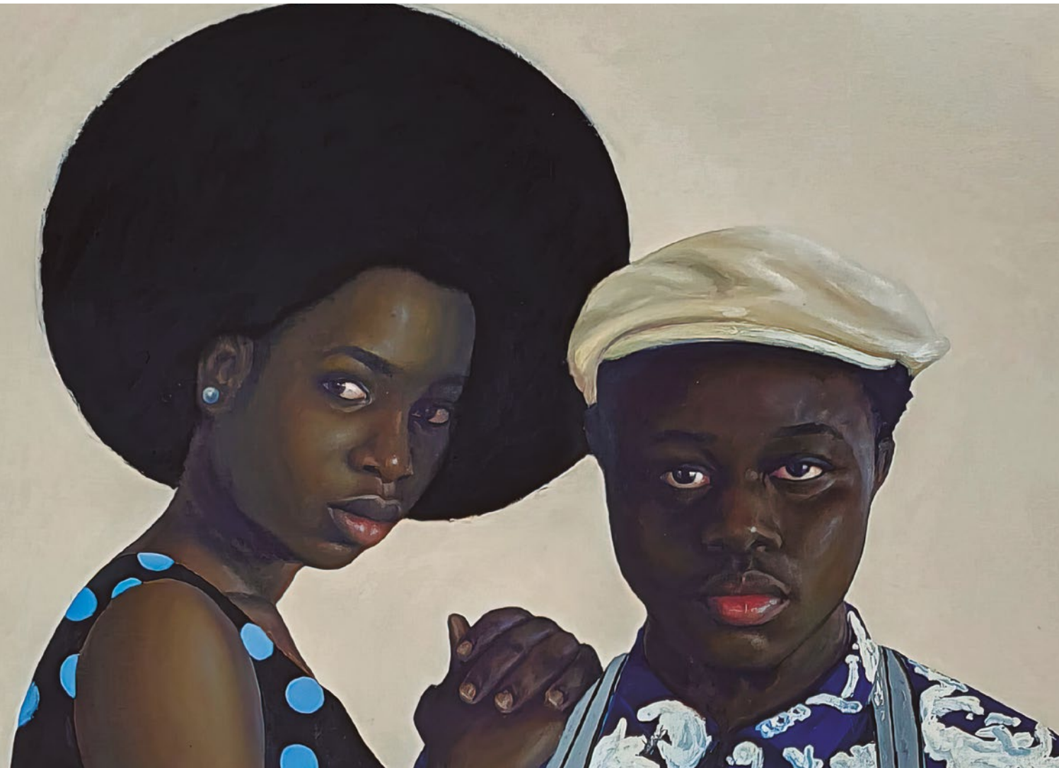
SOUL PROVIDER | 2022 ▶

To the credit of most artists, and indeed, the art industry at large, contrary to earlier predictions and expectations of a slump in the market reminiscent of the Wall Street crash a century prior, not only did many artists survive through the pandemic and experience greater productivity, and depth in their work, but they also thrived.