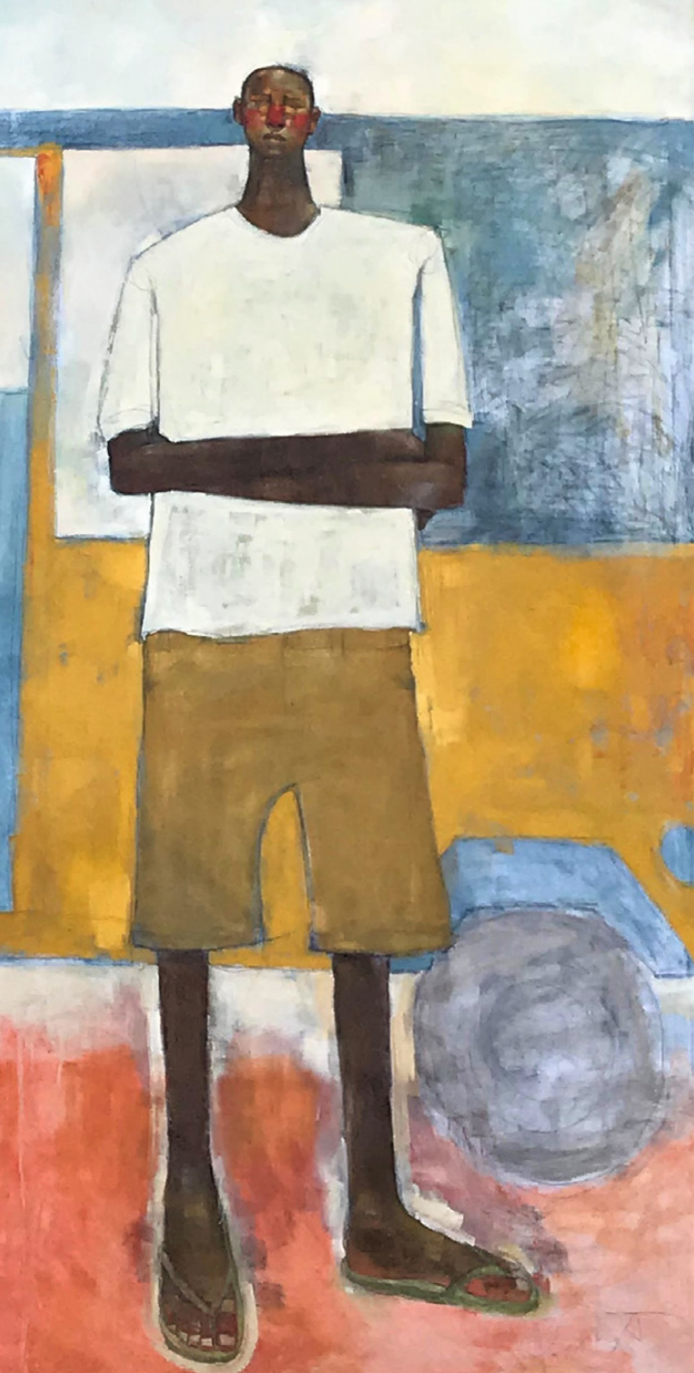
TUK TUK | 2020 183cm H x 183cm W Oil on canvas ENQUIRE