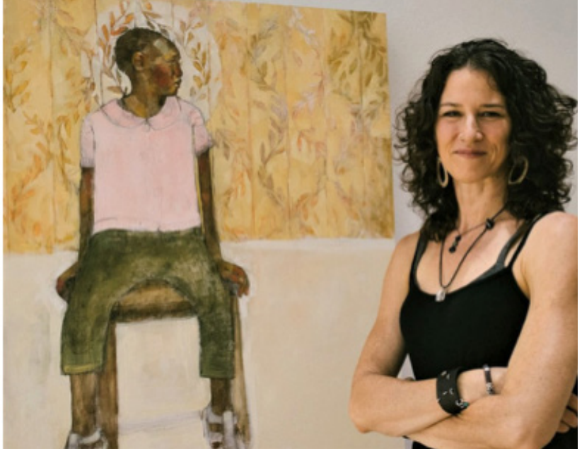
The artist Olivia Mae Pendergast (USA/Kenya)